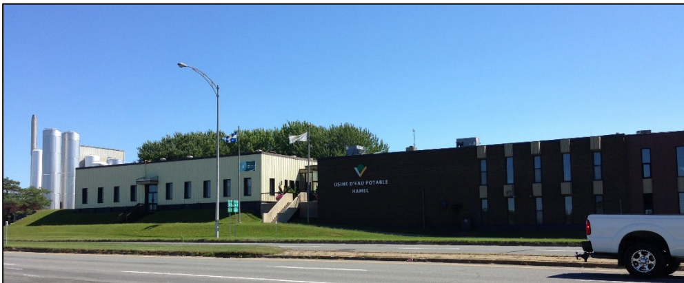
Drinking water treatment plant of Victoriaville