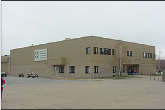
Centre de formation en entreprise et récupération (CFER)