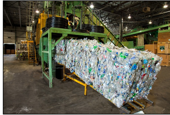
Sorting Center of Victoriaville