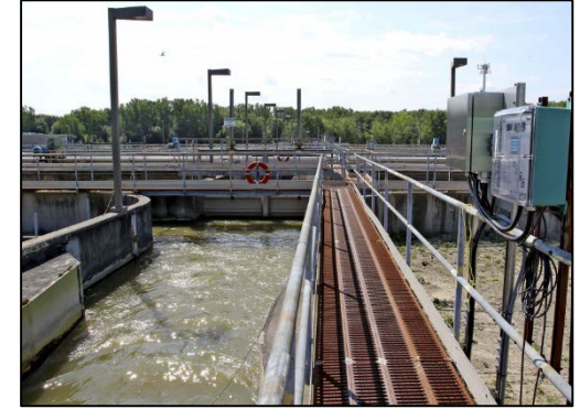
Municipal wastewater treatment plant of Victoriaville